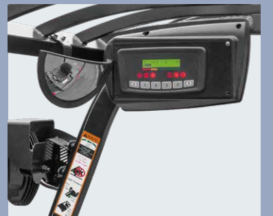
Easy to see display