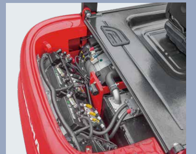
Easy for maintenance