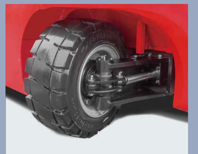
Smaller turning radius